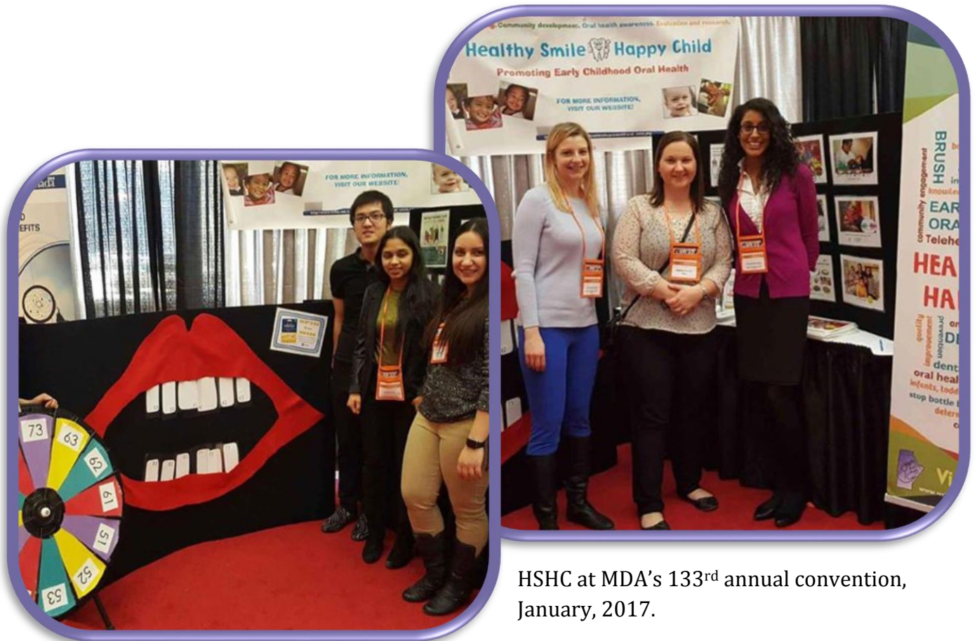
HSHC at MDA's 133 rd annual convention, January, 2017.

The Manitoba Partnership for the Prevention of Early Childhood Tooth Decay